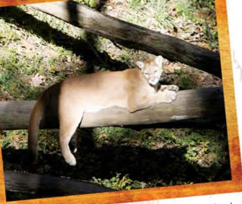
Cougars are champion jumpers - some having the ability to leap more than thirty feet!