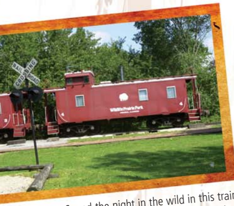
Spend the night in the wild in this train caboose that sleeps four with all the amenities.